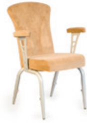
DSC 404 WITH ARMS