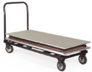
IFT RECTANGULAR TABLE TROLLEY