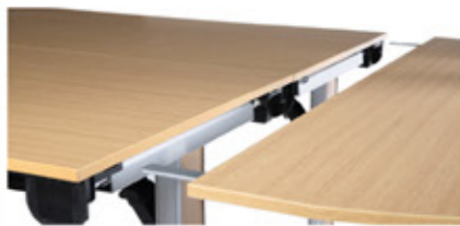
EASY TO CONNECT END UNITS