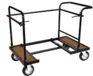
DANCE FLOOR TROLLEY