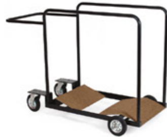
DURAMAX ROUND TABLE TROLLEY