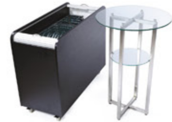
IFC 844 WITH STORAGE UNIT