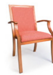
AL DSC 411 WITH ARMS