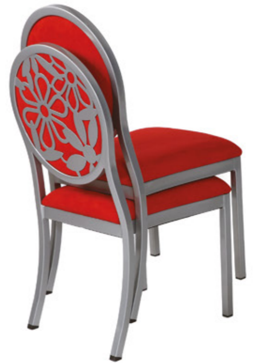
DSC 802 WITH BACK PLATE DESIGN