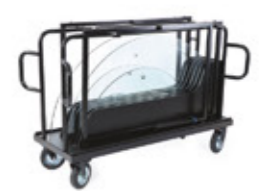
IFC 851 TROLLEY