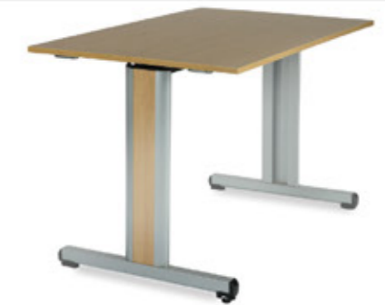
VARIOUS SIZES AVAILABLE