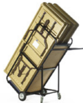
DURAMAX RECTANGULAR TABLE TROLLEY