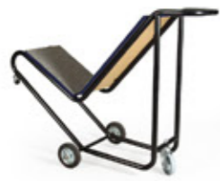
CHAIR TROLLEY C