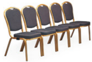
CHAIR LINKING DEVICE