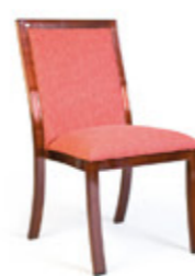
AL DSC 411