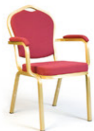
DSC 201AF WITH ARMS