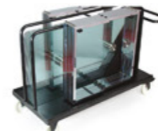
IFBU 849 TROLLEY