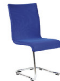
O 2 MBS CANTILEVER