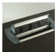
CONCEALED POWER AND DATA UNIT