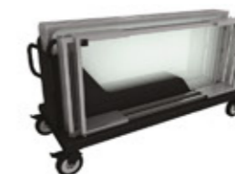
IFC 850 TROLLEY