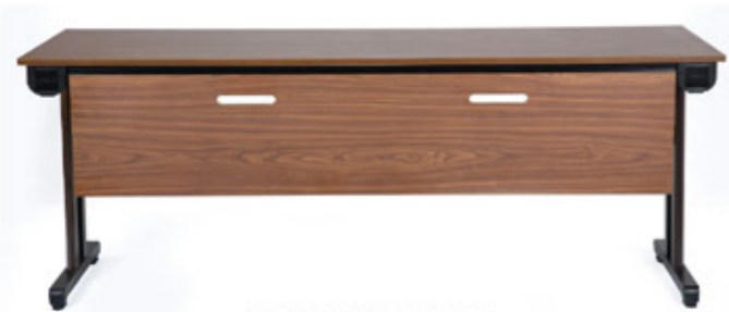
FRONT MODESTY PANEL