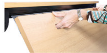
EASY TO INSERT PANEL