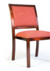
AL DSC 413