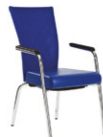
O 2 MB TASK