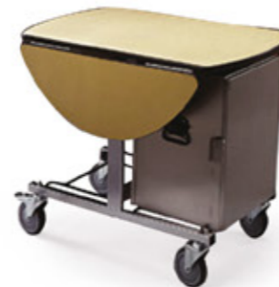
ROOM SERVICE TROLLEY WITH FOOD WARMER