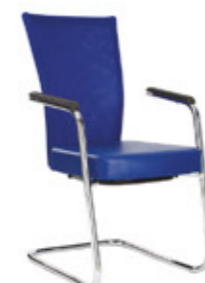
O 2 MB CANTILEVER