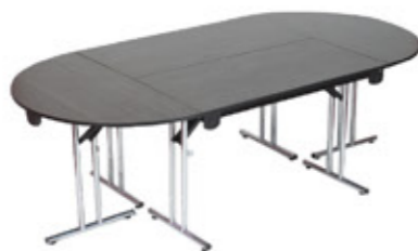
CP TABLE WITH EXTENSIONS