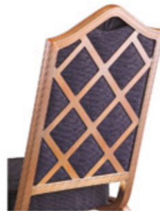
BACK PLATE DESIGN