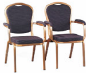
ARM LINKING DEVICE