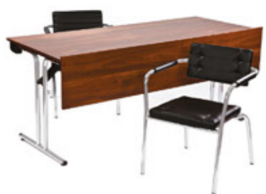
CP TABLE WITH DETACHABLE FRONT MODESTY PANEL - WOOD