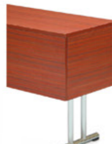
END MODESTY PANEL