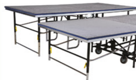
MULTI-HEIGHT STAGING SYSTEMS