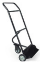
CHAIR TROLLEY B