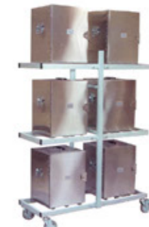
MOBILE FOOD WARMER CADDY