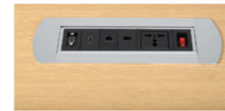
POWER AND DATA UNIT