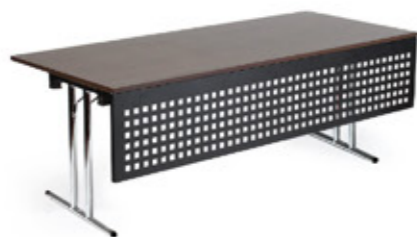
CP TABLE WITH DETACHABLE FRONT MODESTY PANEL - METAL