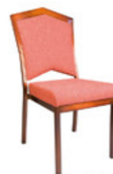
AF DSC 224