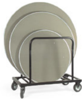
IFT ROUND TABLE TROLLEY