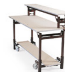
BUFFET SERVICE UNIT