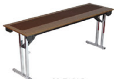
CP TABLE WITH PADDED TOP