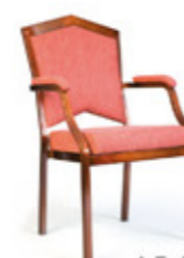
AF DSC 224 WITH ARMS