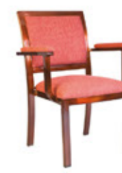
AL DSC 413 WITH ARMS