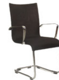
O 2 MBSA CANTILEVER