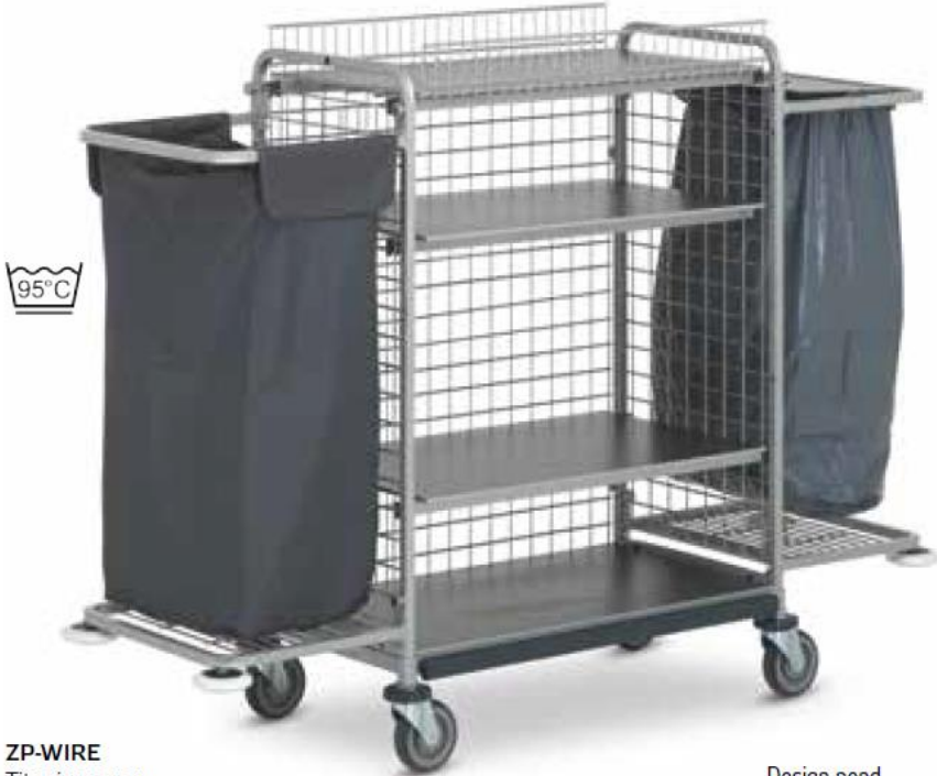
ZP-WIRE Titanium grey